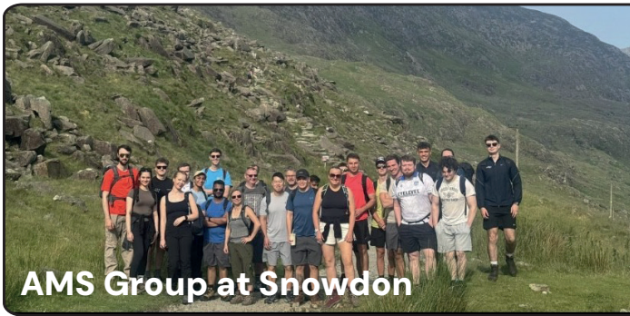
AMS Group at Snowdon